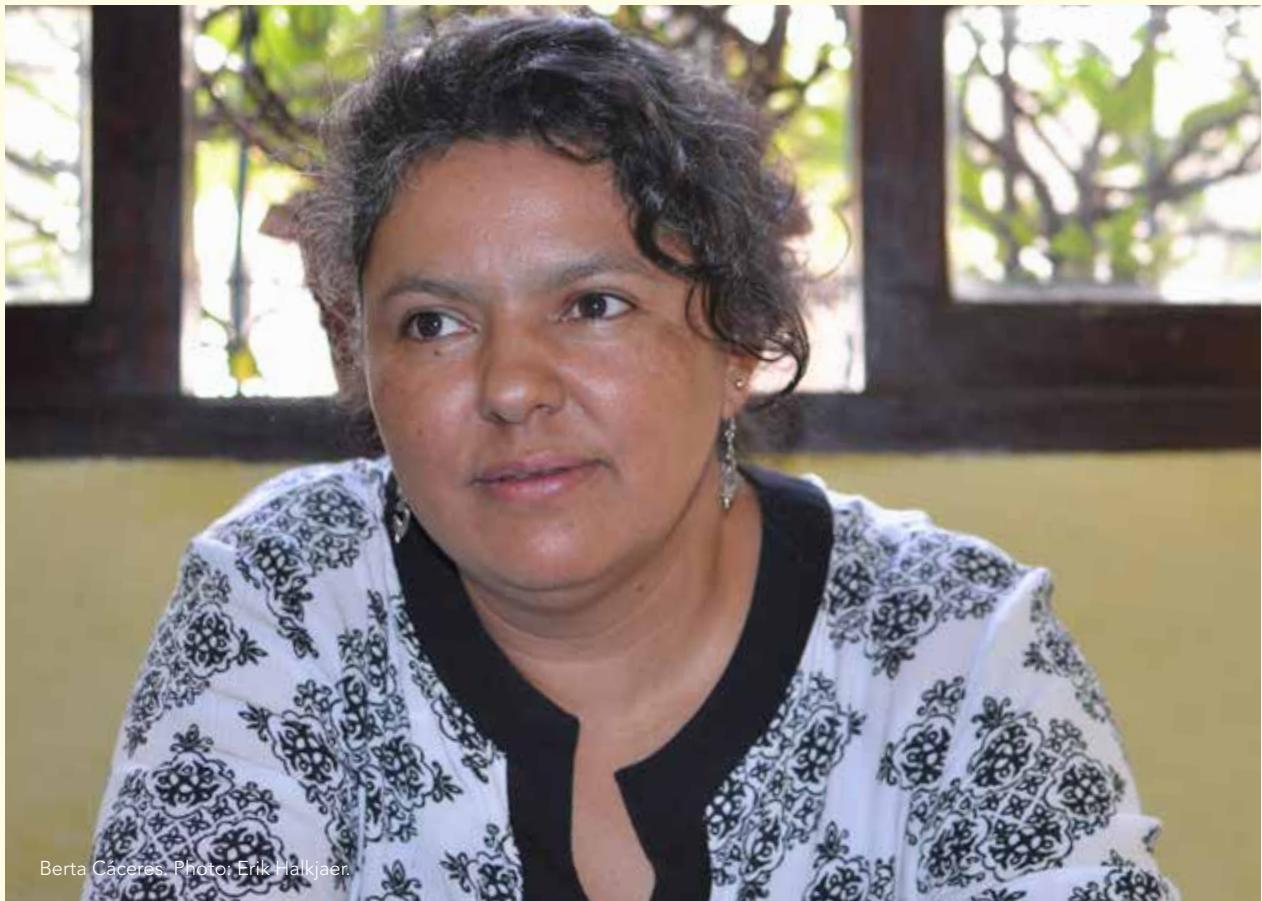
Berta Cáceres.